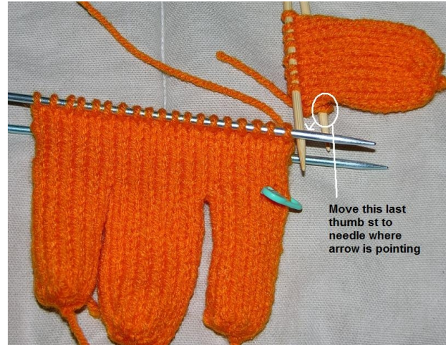
Fig6: Preparing the thumb to be added.

Begin working the thumb on as with the right hand up to where it says "Continue right hand as follows" but change to left hand as follows: