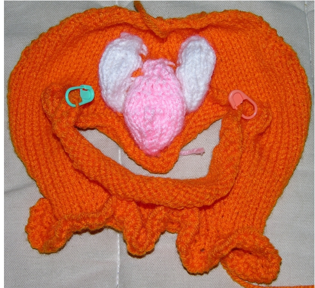
Fig1: Head before seaming, stuffing, etc.

R37: K2tog, k to last 2 sts, k2tog (54) R38: P12, p2tog; repeat (50) R39: K11, k2tog; repeat (46) R40: Purl R41: K2tog, k10; repeat (42) R42: Purl R43: K9, k2tog; repeat (38) R44: Purl R45: K2tog, k8; repeat (34) R46: Purl R47: K7, k2tog; repeat (30) R48: Purl R49: K2tog, k6; repeat (26) R50: Purl R51: K5, k2tog; repeat (22) R52: Purl R53: K2tog, k4; repeat (18) R54: Purl R55: Inc1, k1; repeat (30) R56: Inc1, p1; repeat (45) R57: Inc1, k2; repeat (60) R58: Inc1, p4; repeat (72) BO purlwise, leaving a long tail for seaming later.