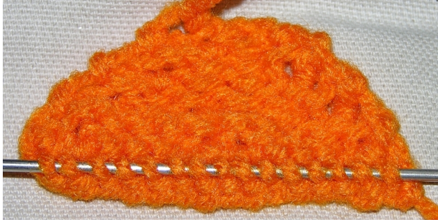
Fig2: Completed eyelid with sts picked up along bottom edge.

Pick up 15 sts from the purled underside, one row back from edge (see Fig 2).