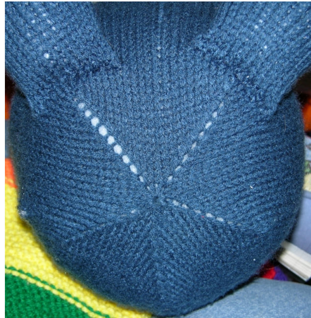
Fig4: Legs stitched onto bottom of body.

Stuff foot and leg firmly. Push closed and tapered end of leg into foot and pin in place (pushing two spare DPNs through crosswise allows for a fast and secure hold that can be modified easily). Using yarn matching the foot, sew in place below ruffled edge. Sew up cast-on edge of leg and attach to underside of body so they point forward, just against where the body starts to curve upwards, lined up with the two forward-facing reduction lines as shown in the photo (Fig 4).