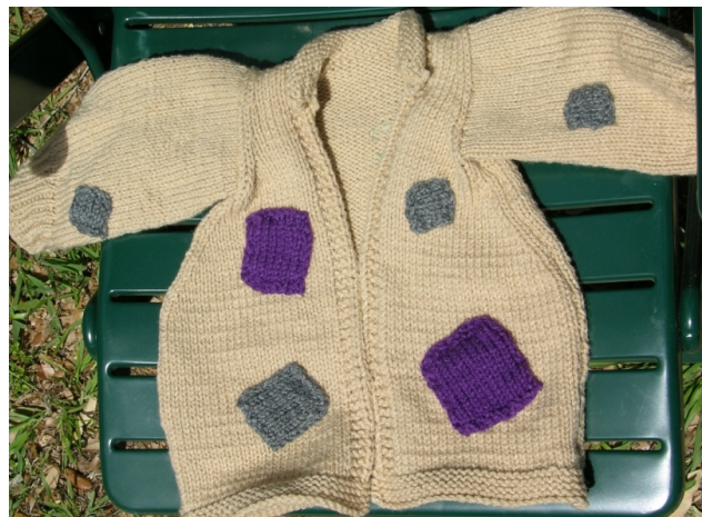
Fig 9: Front of coat.