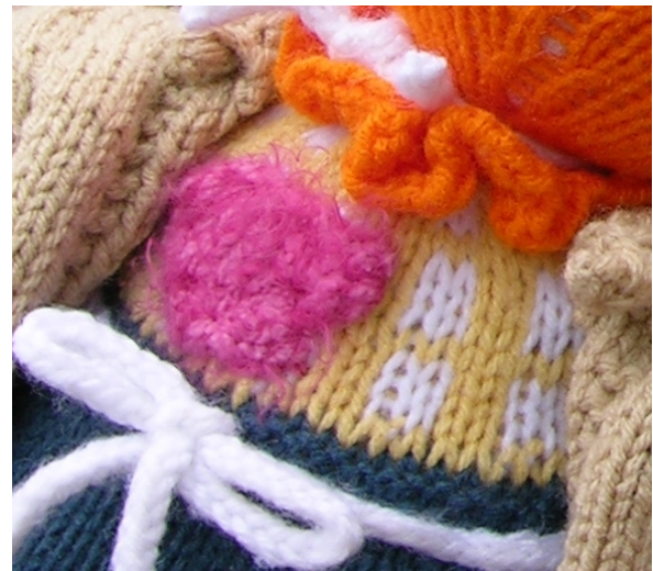
Fig11: Chest patch.