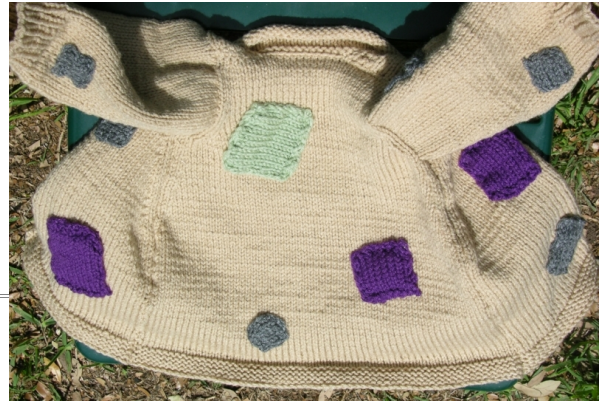
Fig10: Back of coat.

Where possible, tie cords on tightly and affix with a few stitches of white thread for safety if toy will be given to a small child. On the waist, pin it in place and stitch on with white thread.