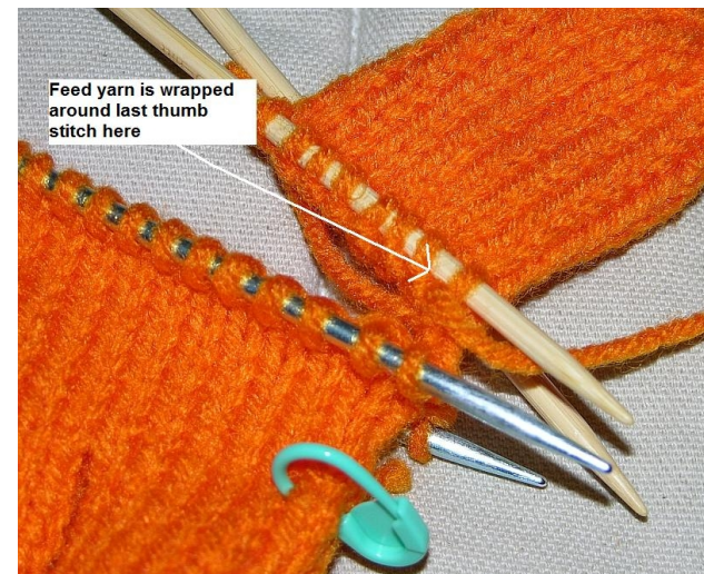
Fig7: Incorporating the thumb sts into the hand.